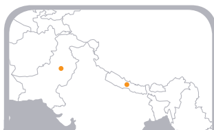
Case studies featured here were conducted in Nepal and Pakistan.