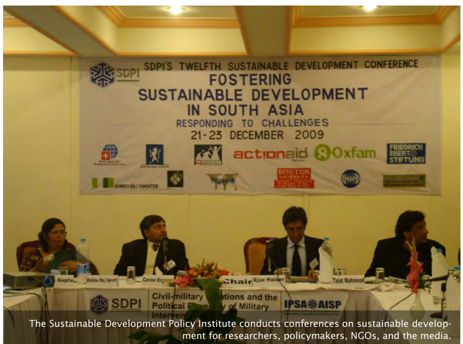
The Sustainable Development Policy Institute conducts conferences on sustainable development for researchers, policymakers, NGOs, and the media.

Policy refers to a set of principles, rules, plans, and procedures for a course of action intended to guide decision-makers or persons with the authority to achieve the stated goals. It includes stated commitments to a plan of action or guidelines among those in government, the private sector, research, and academic organisations.