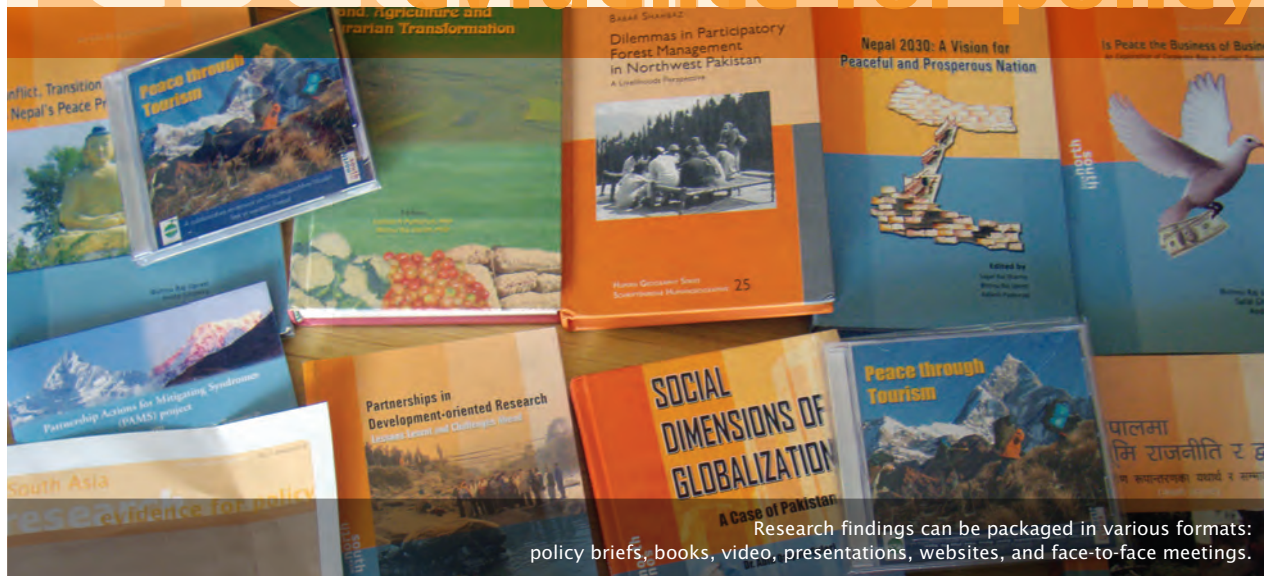
Research findings can be packaged in various formats: policy briefs, books, video, presentations, websites, and face-to-face meetings.