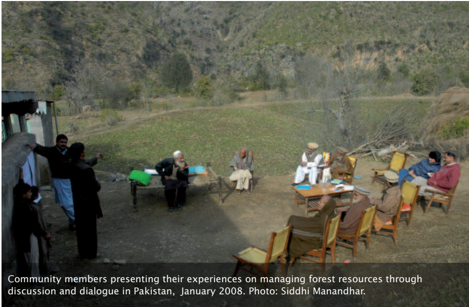
Community members presenting their experiences on managing forest resources through discussion and dialogue in Pakistan, January 2008.

By designing a series of debates and dialogues among the stakeholders, the facilitator can help them understand each others' positions and explore different options to solve the problems.