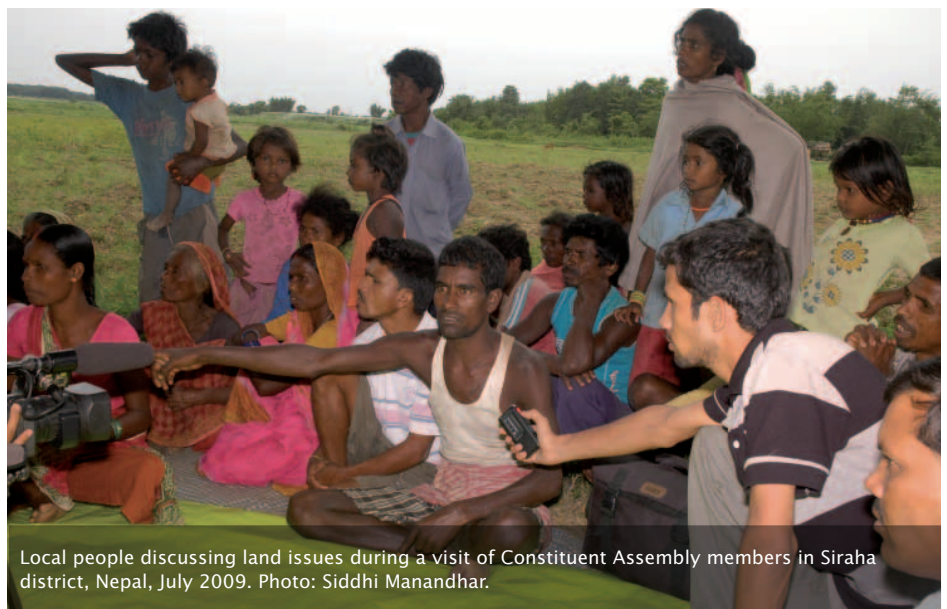
Local people discussing land issues during a visit of Constituent Assembly members in Siraha district, Nepal, July 2009.

As a provider of a neutral platform for engagement: Obtaining the desired outcomes from the dialogue, meetings and discussions requires a neutral environment (venue, space, assistance, etc.). Research organisations can provide such a neutral platform for engagement and dialogue.