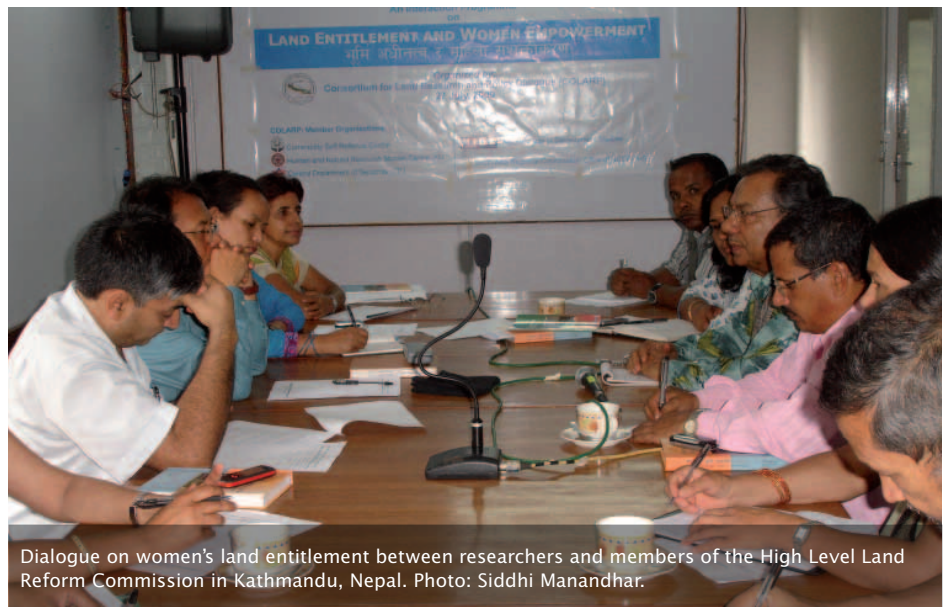
Dialogue on women's land entitlement between researchers and members of the High Level Land Reform Commission in Kathmandu, Nepal.

The Pakistan Research Group is composed of researchers from the Sustainable Development Policy Institute, Islamabad, the University of Agriculture, Faisalabad, and the Development Study Group of the Department of Geography, University of Zurich.