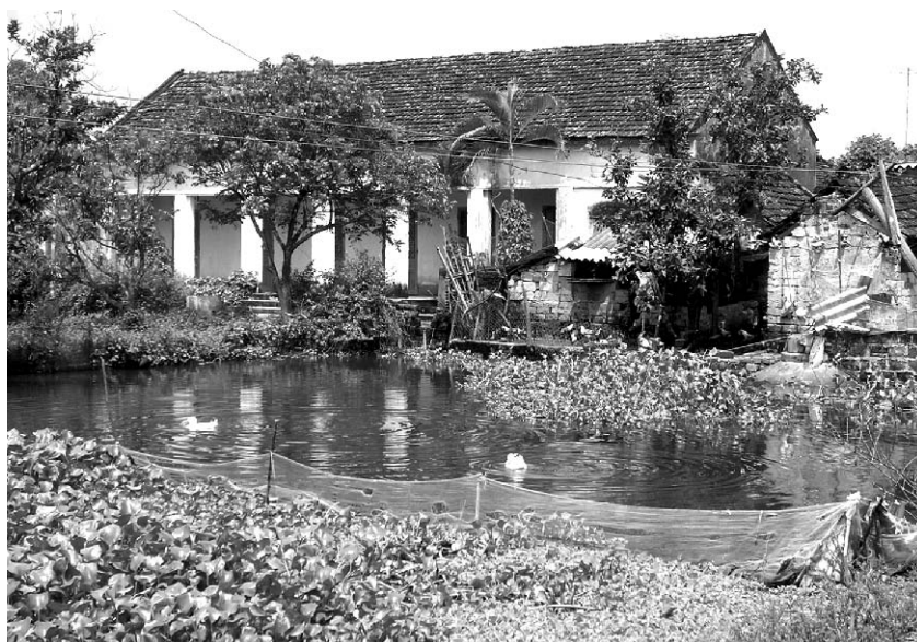
Fig. 1 House with fish- pond at the site of a case study in northern Vietnam.

culture in Pathumthani Province, Thailand, were identified for different scenarios (Surinkul and Koottatep 2009). Risk assessment focused on different groups of people, such as farmers working in the fields, highly exposed to wastewater. It showed that the proposed intervention scenarios could significantly reduce health risks and improve the environment. High health risks for consumers of vegetables irrigated with wastewater were investigated using QMRA, in the course of which two key protozoa causing diarrhoea – Entamoeba histolytica and Giardia lamblia – were recorded (Ferrer 2009). Other studies assessed the infection risk of faecal sludge and organic solid waste management in the same area and concluded that estimated mean values of yearly infection risks from accidental ingestion of canal water in various scenarios, such as handling organic food and market waste, were higher than acceptable risk levels as defined by the World Health Organisation (Yajima 2005). Epidemiological studies show that 47% of a community in northern Vietnam were infected with helminth and 6% with Entamoeba , and these infections were strongly correlated with use of excreta and wastewater for agriculture, as well as with poor sanitation (Figure 1). Understanding the flows of materials and the associated health risks and pathogens forms the basis for interventions geared towards the particular group at risk. In another study, MFA was used to analyse environmental sanitation and agricultural