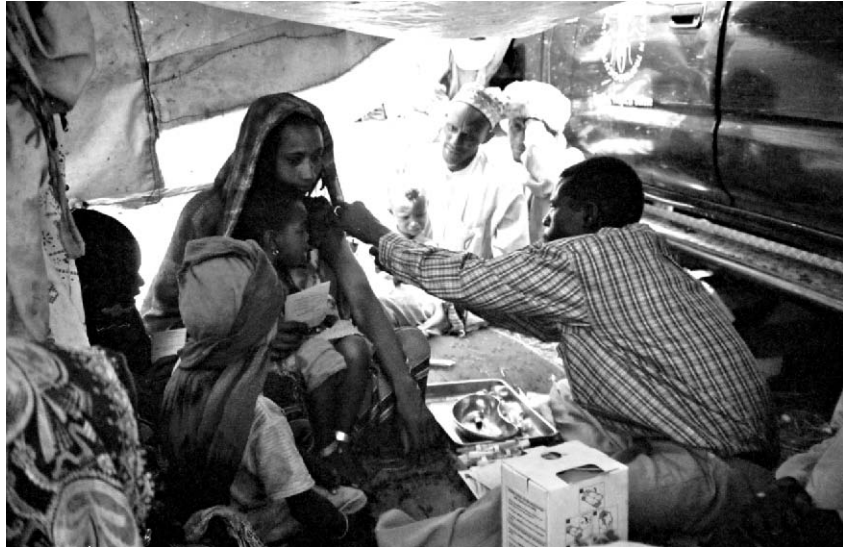
Fig. 4 Nomadic pastoral- ist children receiv- ing their first vac- cinations.

as a parameter of equity effectiveness. For this purpose, new methods to estimate human population size and to repeatedly identify the same person were developed and tested. Under very difficult security conditions, a proof of principle regarding mobile demographic surveillance could be established using electronic fingerprint technology with capture–mark–recapture methods (Weibel et al 2008). Mark–recapture techniques, however, did not allow for collecting sufficient repeated identifications of persons within a reasonable time frame; the approach will, therefore, be further refined by using social network information to rapidly identify previously registered members of the community. The ultimate aim of this research is to establish vaccination coverage and health status among nomadic pastoralists by means of demographic surveillance, which will make it possible 1) to compare equity in health care provision to mobile and sedentary populations and 2) to subsequently adapt primary health care provision to reduce inequities within the national population. The results are encouraging and provide a basis for working out differentials in equity for the benefit of excluded and neglected urban and rural populations. They also comprise tools to develop demographic surveillance of populations that are not yet covered. Future demographic surveillance of mobile populations and their animals will form the basis for social planning and more careful use of natural resources.