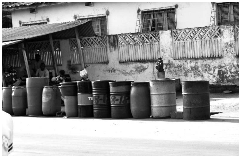
Fig. 2 Water sale in Bouaké, Côte d'Ivoire.

bodies, and communities can join efforts to provide sufficient safe water and improved sanitation to all inhabitants and particularly to those most in need.