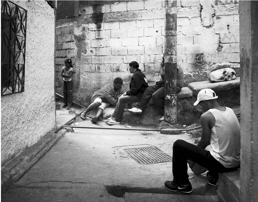
Fig. 1 People playing bingo in a corner of the barrio Santa Cruz of Caricua, South Caracas: How do they perceive security and insecurity in their city?

The concept of human security proved to be extremely helpful in reconceptualising the prevailing and dominant perception and understanding of what makes for a safe – and of course an unsafe – city in Caracas. A ‘safe city’, for political scientists, criminologists, and sociologists, is one where, in order to attain an acceptable quality of life, security is assured by means of prevention and suppression of direct violence by the main actors of a traditionally defined security sector: the military and the police (Pedrazzini 2005). From this perspective, security is achieved when crime, violence, and corruption are fought and significantly reduced through deterrence and counter-violence. However, such thinking in the urban context has also led to the phenomenon that political scientists call ‘security dilemma’ – the spiral of violence, counter-violence, and reciprocal violence. State-driven use of force to oppress violence results in more societal violence, a sense of state oppression, and, most importantly, overall neglect of many other sources of (structural) violence and threats to the population’s basic existence and well-being.