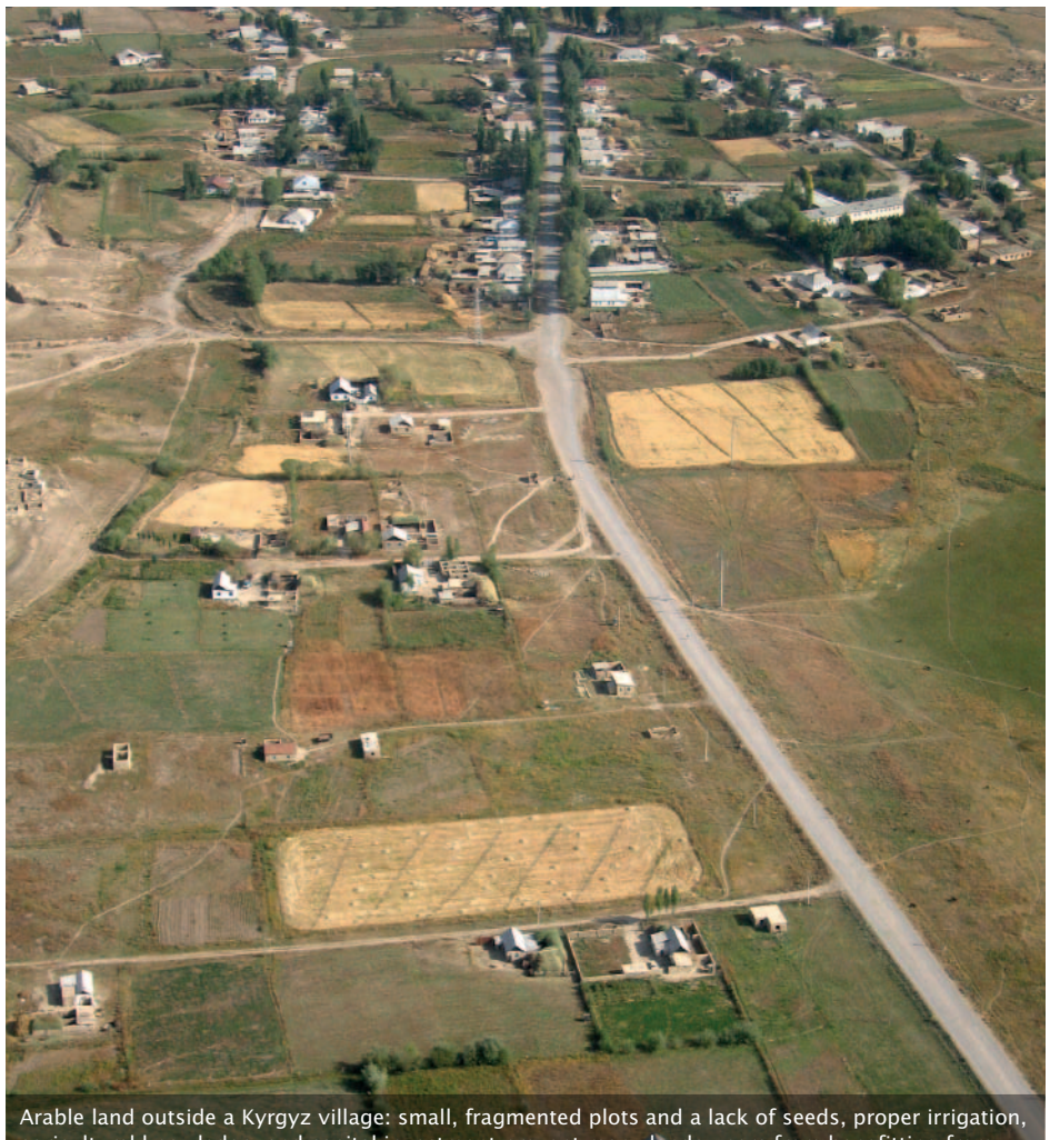
agricultural knowledge, and capital investment prevent many landowners from benefitting from their land.