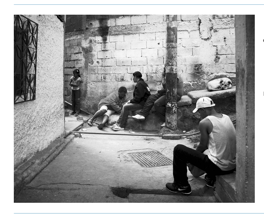
Fig. 1 People playing bingo in a corner of the barrio Santa Cruz of Caricua, South Caracas: How do they perceive security and insecurity in their city?

The concept of human security proved to be extremely helpful in reconceptualising the prevailing and dominant perception and understanding of what makes for a safe – and of course an unsafe – city in Caracas. A 'safe city', for political scientists, criminologists, and sociologists, is one where, in order to attain an acceptable quality of life, security is assured by means of prevention and suppression of direct violence by the main actors of a traditionally defined security sector: the military and the police (Pedrazzini 2005). From this perspective, security is achieved when crime, violence, and corruption are fought and significantly reduced through deterrence and counter-violence. However, such thinking in the urban context has also led to the phenomenon that political scientists call 'security dilemma' - the spiral of violence, counter-violence, and reciprocal violence. State-driven use of force to oppress violence results in more societal violence, a sense of state oppression, and, most importantly, overall neglect of many other sources of (structural) violence and threats to the population's basic existence and well-being.