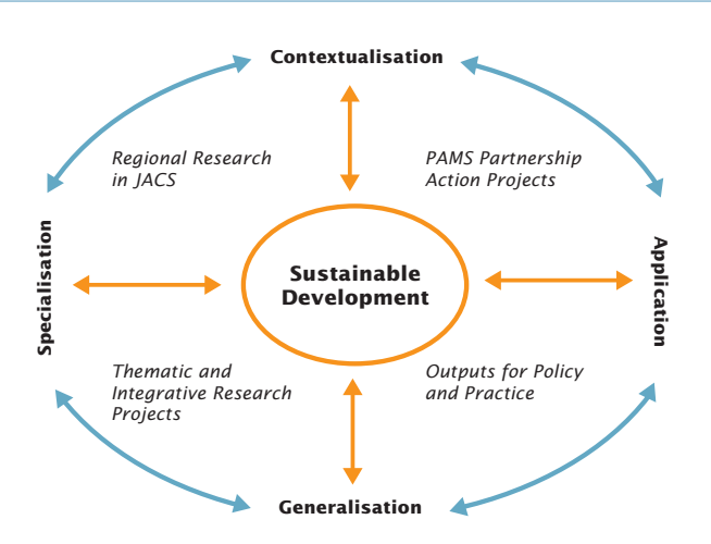
Fig. 4 Research directions (in bold) and components (in italics) that constitute the research approach of the NCCR North-South (2009). JACS: see Endnote 4; PAMS: see Endnote 5.

Contextualisation is the direction taken in research aimed at achieving more sustainable development in concrete situations, as this requires contextual differentiation and, in most cases, transdisciplinary dialogue. The nine partnership regions function as focal points and platforms for concrete partnership-based research, and partnership action projects<sup>5</sup> enable exchange and joint knowledge generation with non-scientific stakeholders. Within its nine partnership regions, the NCCR North-South focused on three main syndrome contexts – the urban and peri-urban, the semi-arid, and the highland–lowland contexts – during its previous phases. These contexts are emphasised less in the final phase of the programme, although at times they are still used as a meta-level reference in the synthesis projects. Contextualisation always involves production of all three types of knowledge – systems, transformation, and target knowledge.